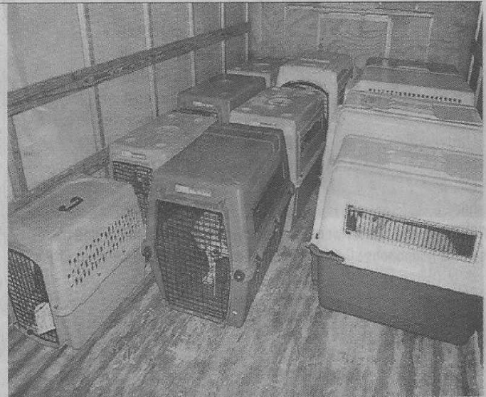
New legislation passed in 2024 prohibits harmful dog-breeding practices and mistreatment of puppies and their mothers.

descriptors and proof of spay or neuter of each animal